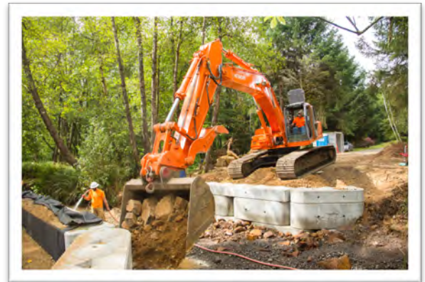
DURING: Construction was completed by CatWorks, which did an excellent job materializing SSH partnership's vision in real time.