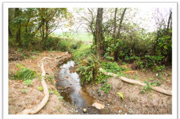
DURING: The streambed was reconstructed using streambed simulation methodology which emulates the stream's natural bedform to create optimal fish habitat and passage.