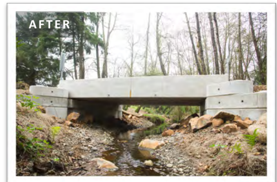
AFTER: The two barrier culverts were removed and replaced with one 16' clear span concrete modular bridge, restoring full volitional access to 0.5 miles of spawning and rearing habitat.