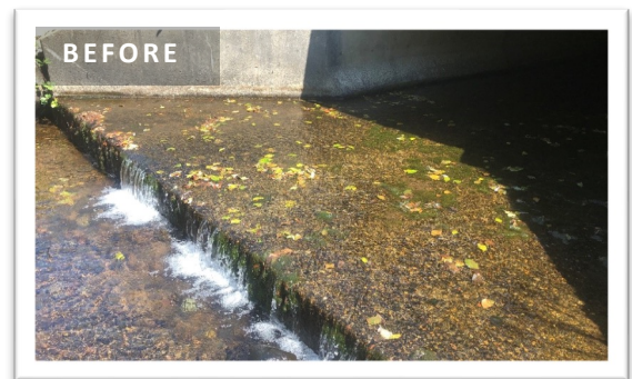
BEFORE: The culvert at Munson Creek had a 1' perch that impeded native fish passage.

TOTAL PROJECT COST: $175,000 ODOT Fish Passage and Major Culvert Maintenance Programs