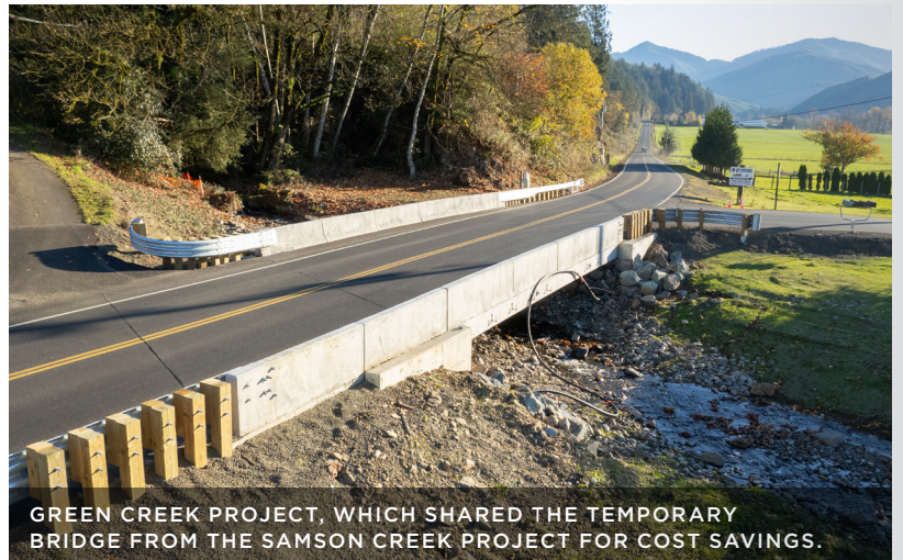
GREEN CREEK PROJECT, WHICH SHARED THE TEMPORARY BRIDGE FROM THE SAMSON CREEK PROJECT FOR COST SAVINGS.