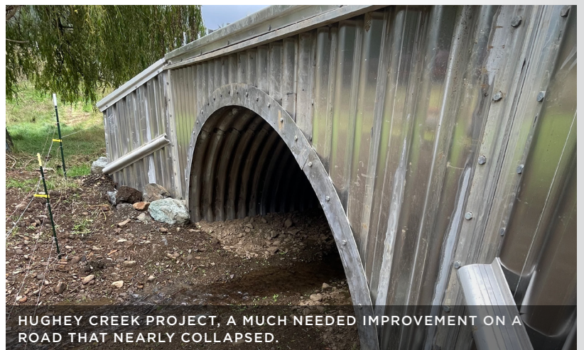
HUGHEY CREEK PROJECT, A MUCH NEEDED IMPROVEMENT ON A ROAD THAT NEARLY COLLAPSED.

FOR MORE INFO PLEASE VISIT US AT: SALMONSUPERHWY.ORG