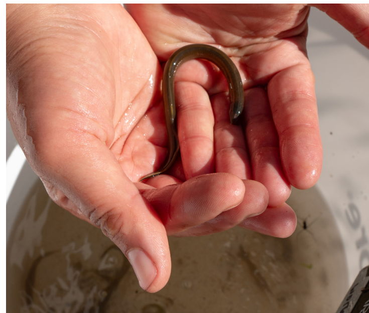
Salvaged lamprey in their ammocoete phase were transferred while the SSH Hughey Creek culvert was replaced.

The continued collaboration and hard work of Salmon SuperHwy partners has resulted in tremendous progress toward our goal of 180 miles of habitat reconnected. The 50 projects completed have restored access to 129 miles of spawning and rearing habitat for Chinook, coho, chum, steelhead, cutthroat trout, and lamprey, and on top of that, they've made Tillamook County's transportation system safer for residents, visitors, and industry. We're making a big push to keep that momentum going until we reach our goal.