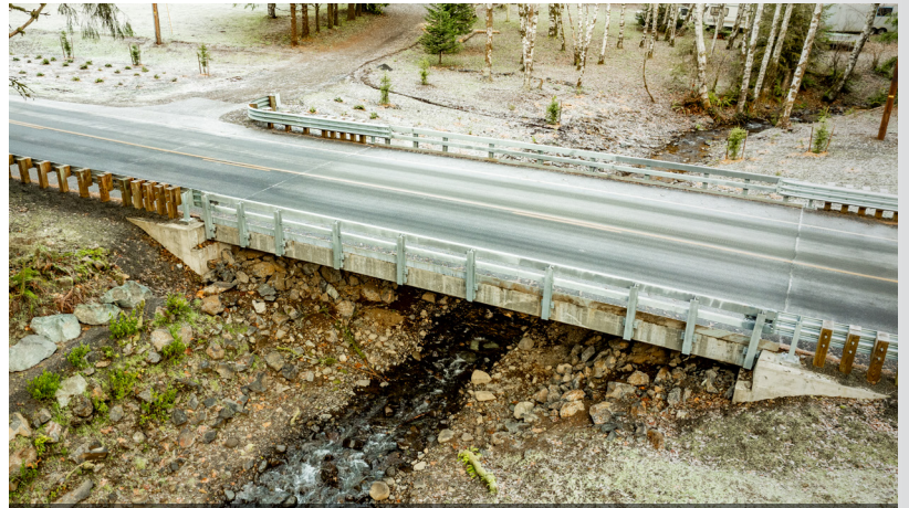
SAMSON CREEK PROJECT, WHICH LEVERAGED $100,000 OF BIL FUNDING.